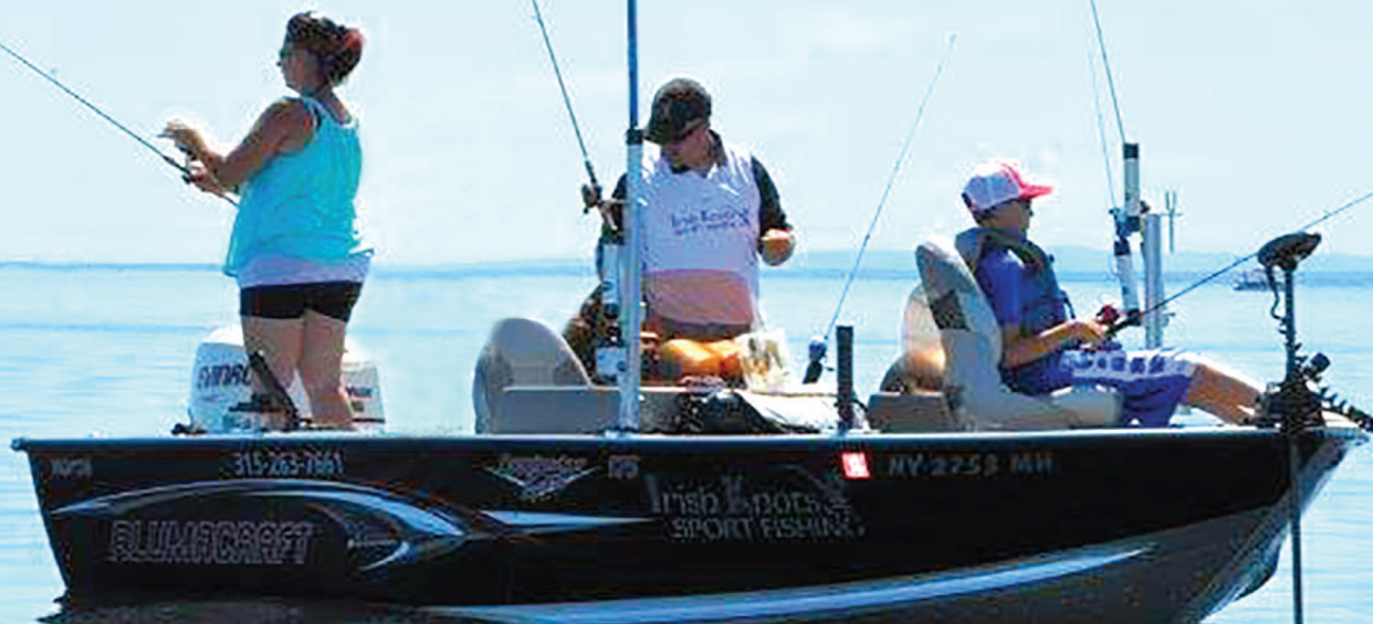
"Lil Knots" - 18' Alumacraft