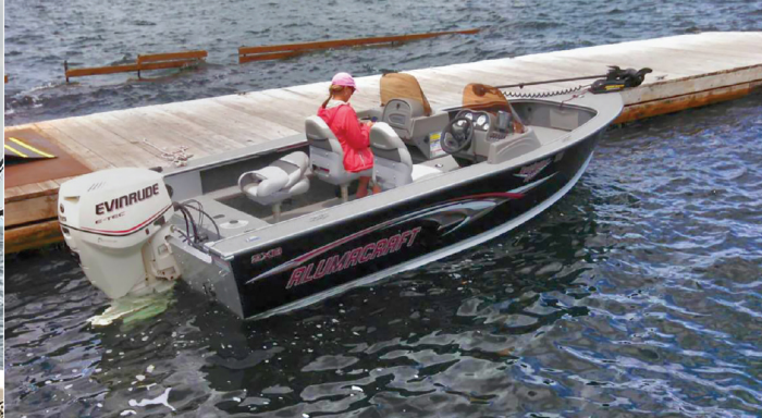
Lil Knots - 18' Alumacraft